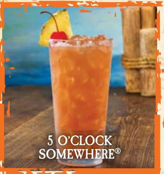
5 O'CLOCK SOMEWHERE®

Myers's® Original Dark Rum blended with blackberry and banana purées, and topped with Cruzan® Hurricane Proof Rum. Served frozen (310 calories)